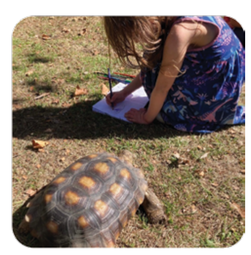
Seven Directions Camp

Free Thursday newsletter! Choc' full of family events and articles! Sign up here.