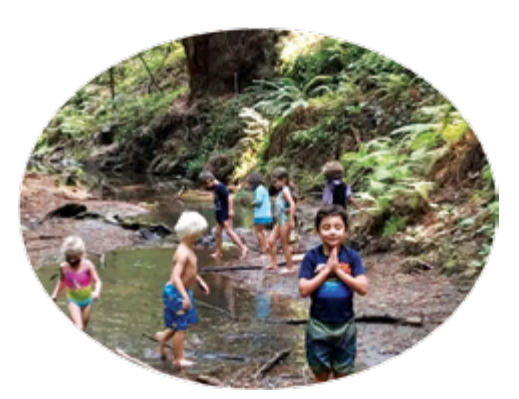
Tara Redwood Camp

SCP sends Free Family newsletters, every Thursday for 18+ years! Sign up here.