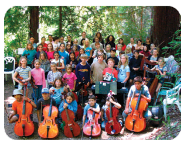
Redwood Music Camp